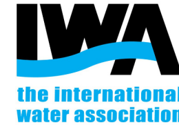
The International Water Association (IWA)